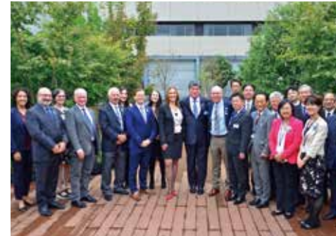
Maple tree Planting Ceremony at the roof top garden

Courtesy call, attending Welcome and Tree Planting Ceremonies, participating in the Itabashi Residents Festival, traditional culture experience and city tours, etc.