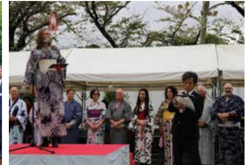
Participated in Itabashi Residents Festival