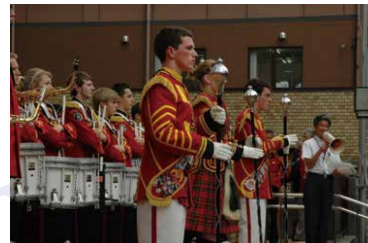
Burlington Teen Tour Band visited Itabashi (2009)