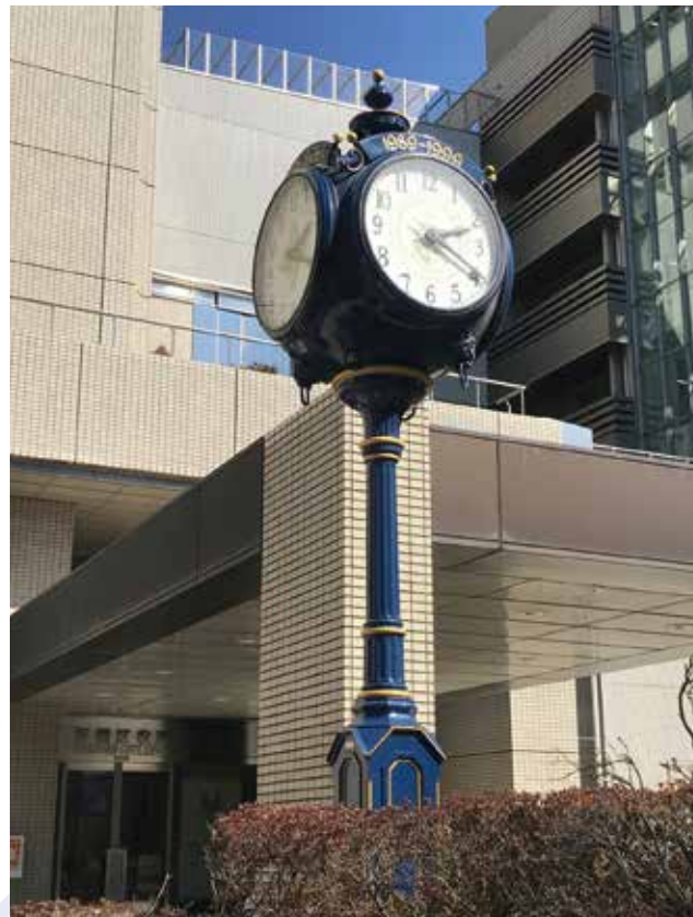
In front of Itabashi City Hall

The Burlington Friendship Clock placed in front of the Itabashi City Hall is a gift of Burlington City in commemoration of the 10th Anniversary of the Twin-city and the replica of the one set in front of Burlington City office. There is thirteen hours difference in time between the cities and two clocks ring the bell at the same time of every hour.