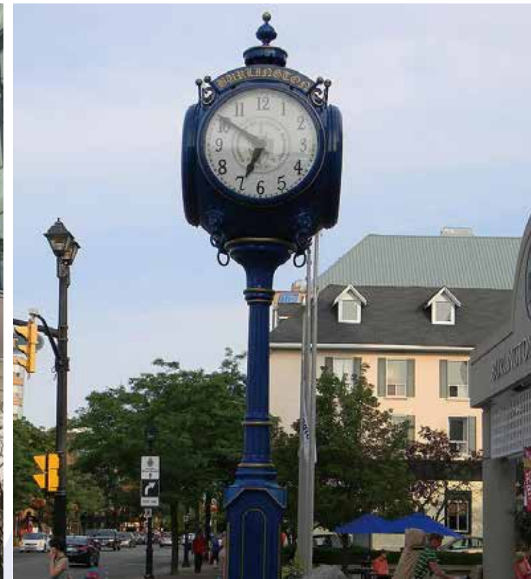
In front of Burlington City Hall