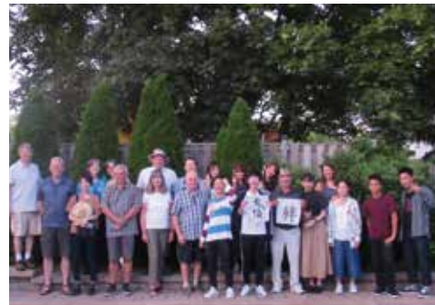
Together with host families