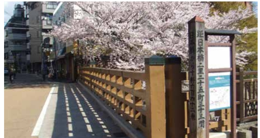
"Itabashi Bridge" in Itabashi