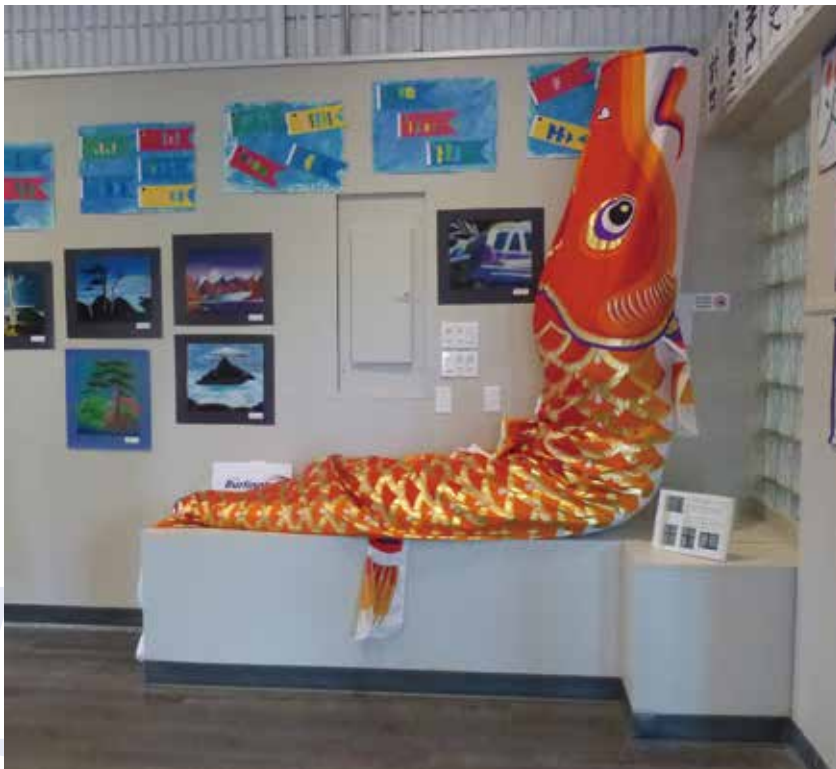
Exhibition at Art Gallery of Burlington

Itabashi and Burlington have various interactions between the citizens of youths including junior and senior high school students.