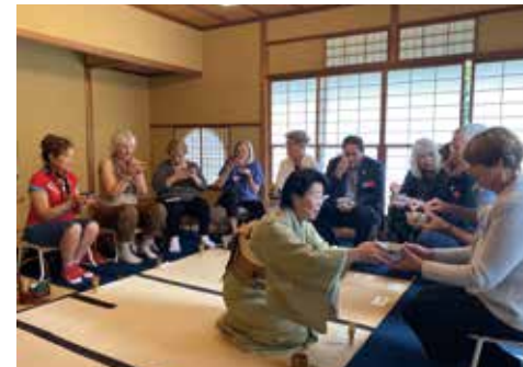
Tea Ceremony at Tokusui-Tei

Burlington citizen of sixteen people visited Itabashi. They exchanged with local people through home-stay, home-visit, and city tour including tea ceremony, visiting high school, participating in the Itabashi Residents Festival, etc.