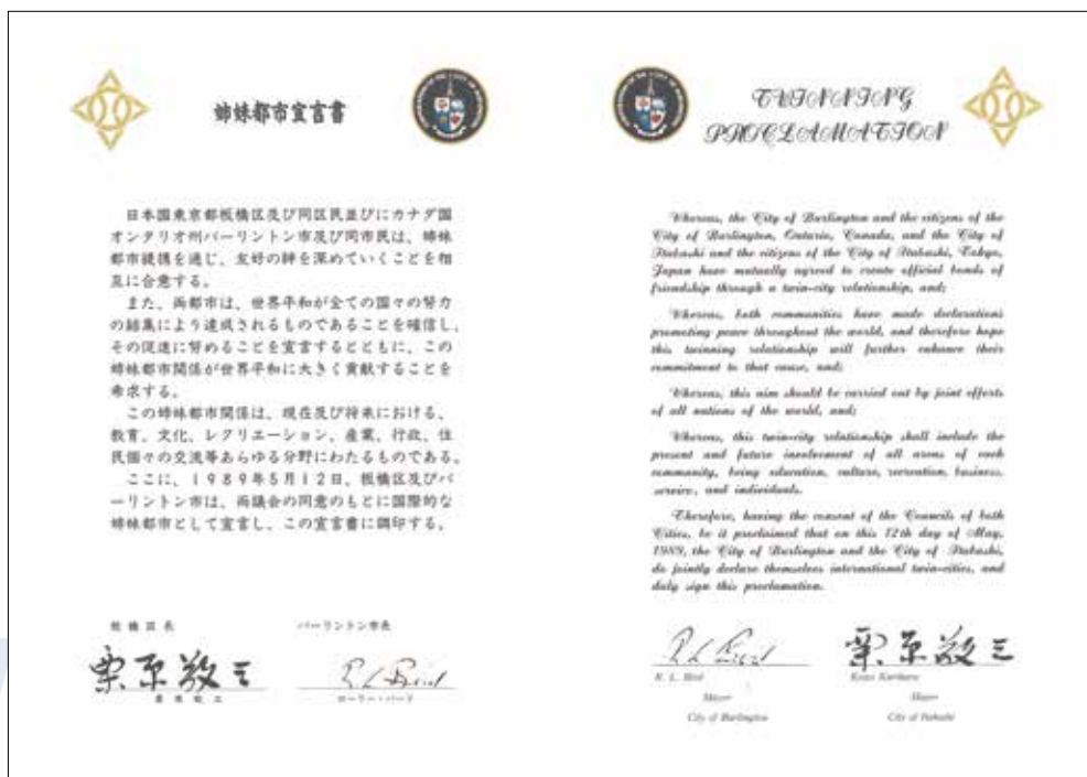
Twinning Proclamation "The common belief that the mutual understanding of the both citizens and deepening friendship among themselves contribute to build a foundation for world peace." (May 12, 1989)