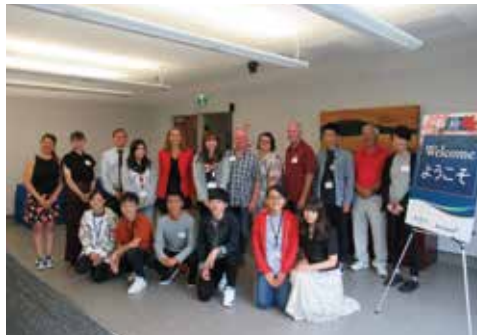
Welcome Ceremony at Burlington City Office

Ten Itabashi youths between 15 to 23 years old visited Burlington. They exchanged with local people experiencing homestay, attending English lessons, sightseeing to the Niagara Falls and Toronto, visiting Students Theater, etc.