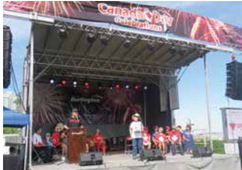
Attended Canada Day commemorative ceremony

Courtesy call, attending the Opening ceremony of the Itabashi Garden, Canada Day Ceremony and city tours, etc.