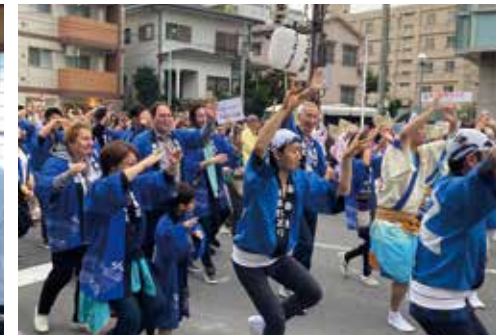
Joined Awa-Odori dance at the Itabashi Residents Festival