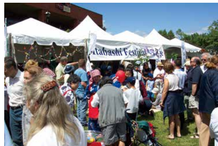
Itabashi Matsuri Stall (2004)