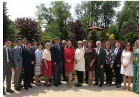
Itabashi Garden Opening Ceremony