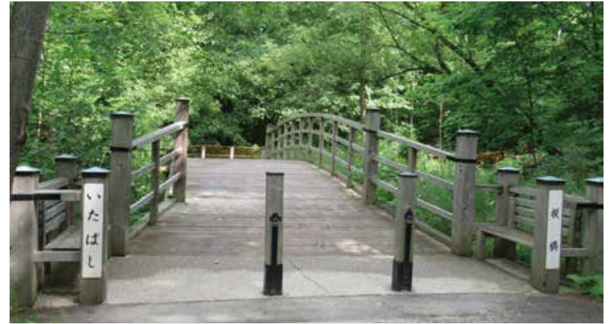
"Itabashi Bridge" in Burlington