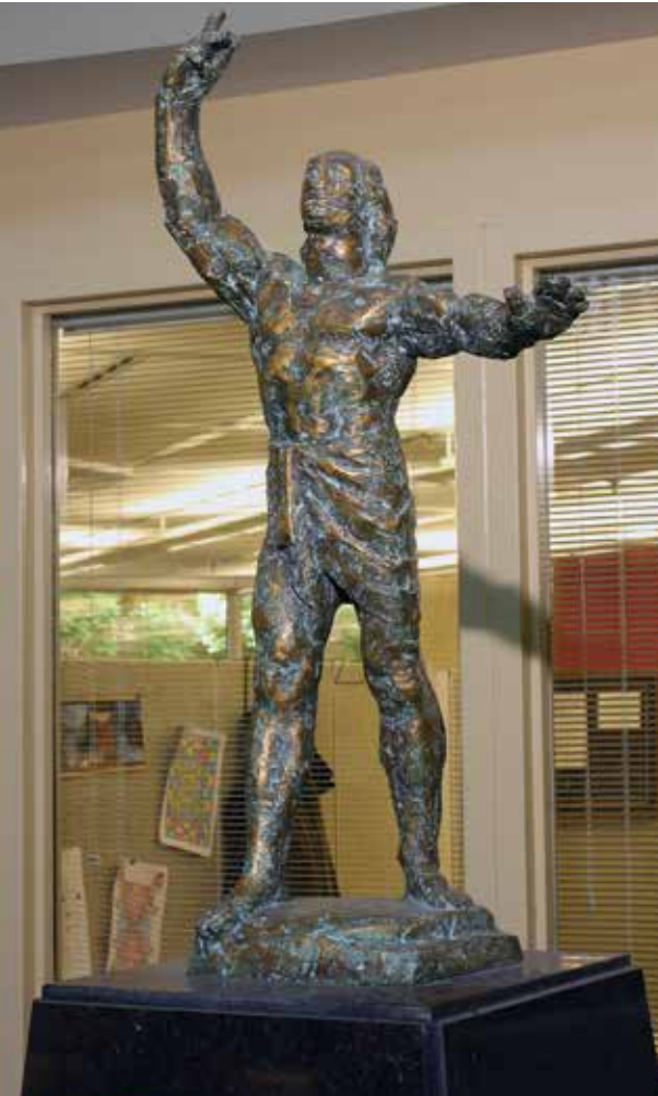
Courtyard of Burlington City Hall