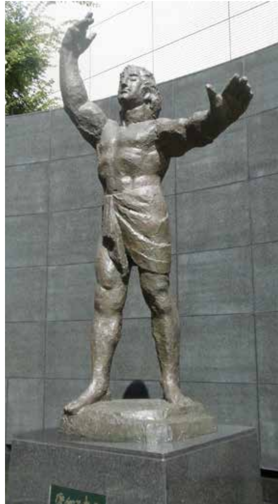
In front of Itabashi City Hall